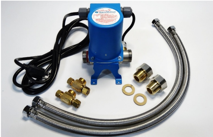
AquaMotionHot One AMH3K-7 Kit Contents