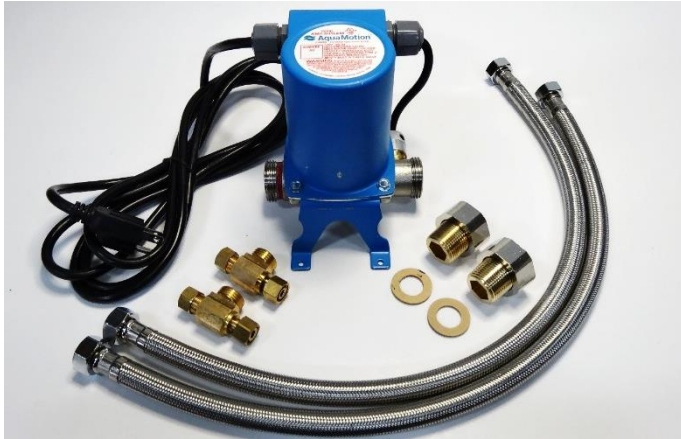
AquaMotionHot One AMH3K-7 Kit Contents