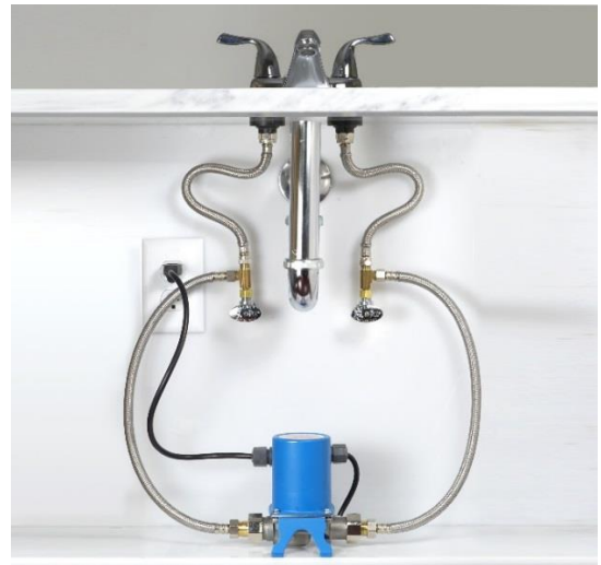
AquaMotionHot One AMH3K-7 Installation Picture