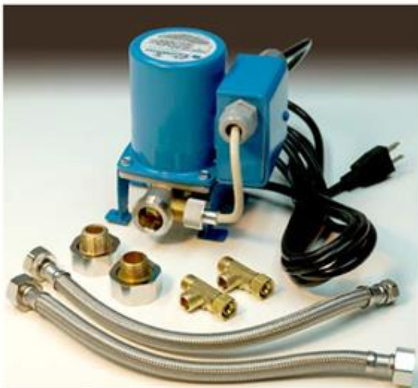
AquaMotionHot One AMH1K-1 Kit Contents