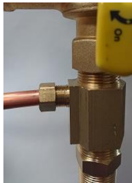
Cold Water Side Installation