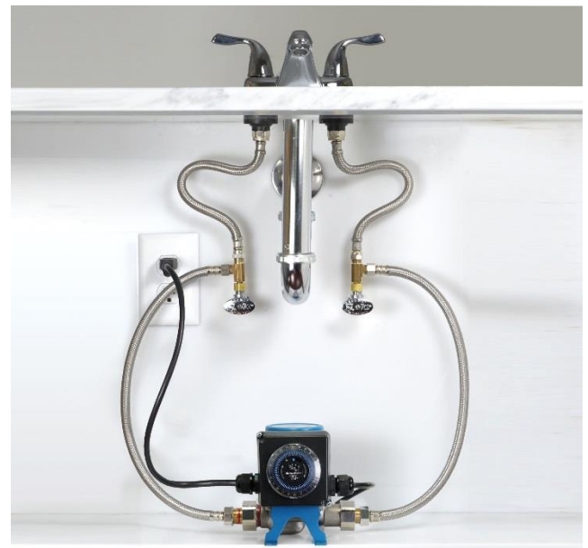
AquaMotionHot One AMH3K-7 Installation Picture