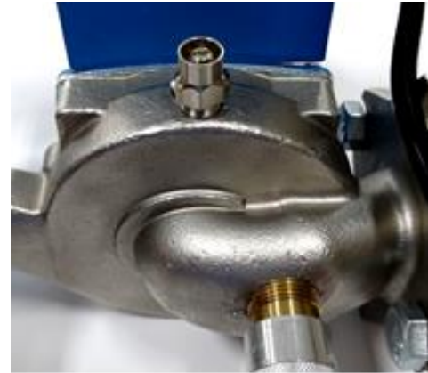
(Figure 3) Air Lock Relief Valve

Stainless hoses are NSF 61-9 listed Circulators are of stainless construction All Fittings are lead free