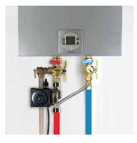
AMK-ODR Bypass Under sink Installation