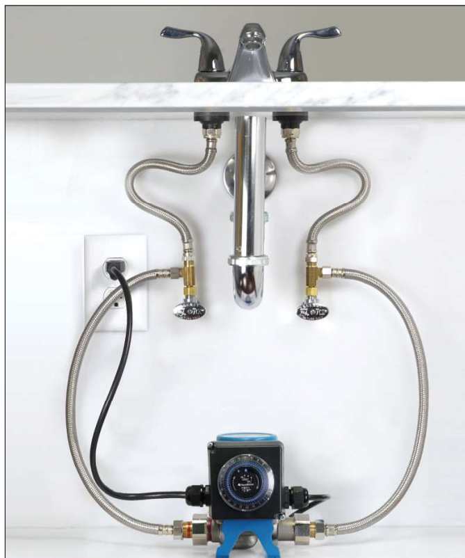
This AquaMotionHot model AMH3K-7 is a hot water recirculation system designed for standard plumbing installations under a sink.

A dedicated return line is a pipe that connects the hot supply line from