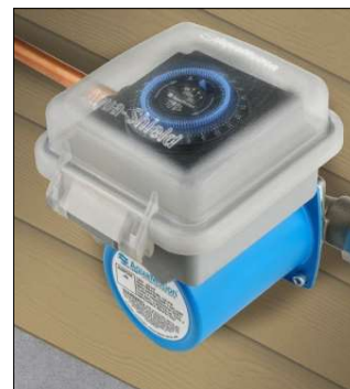
AquaShield outdoor pump from AquaMotion.

Before 1980, homes were equipped with a one-pipe system — a copper pipe from the hot water tank that connected all the faucets in sequence with hot water and ended at the last faucet. Determine if you