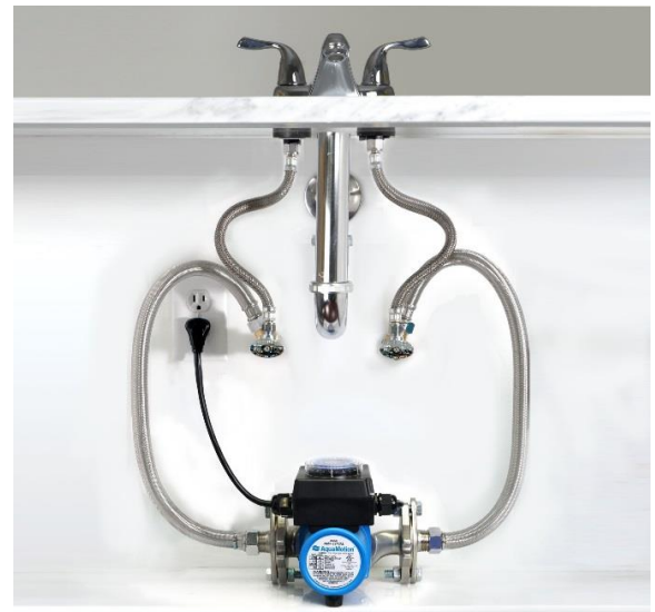
Installation Diagram with Timer