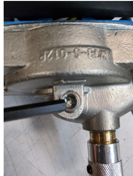
(Figure 3) Air Lock Relief Valve