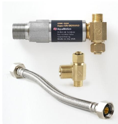
Components for Under Sink Installation