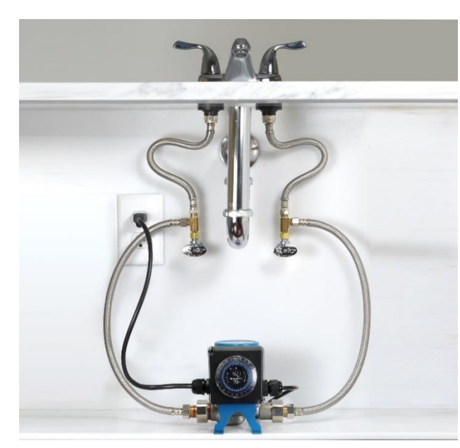
AquaMotionHot One AMH3K-7 Installation Picture