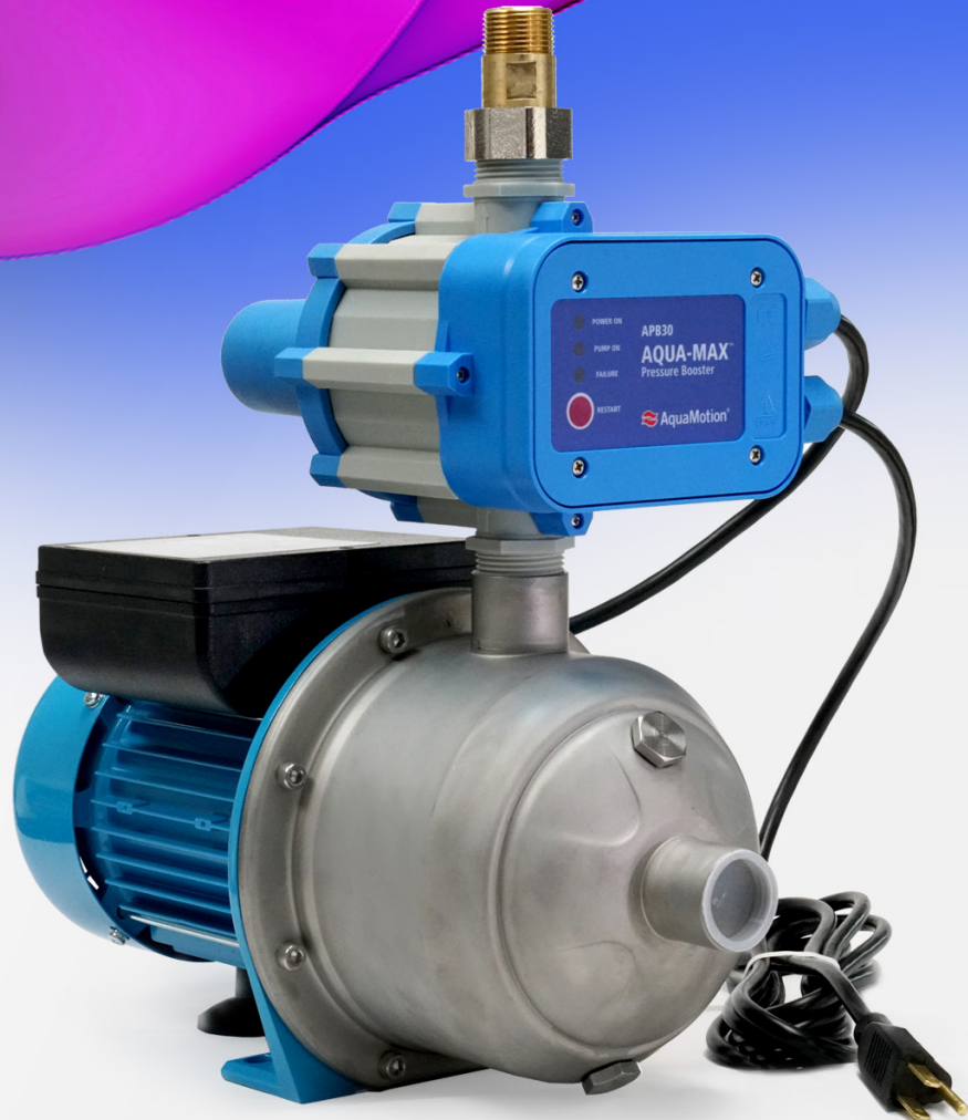
AquaMotion APB 30