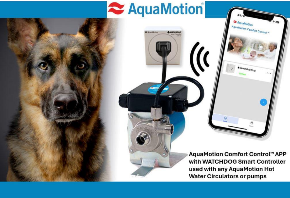
AquaMotion Comfort Control™ APP with WATCHDOG Smart Controller used with any AquaMotion Hot Water Circulators or pumps

AquaMotion Inc. reserves the right to change or modify product design or construction without prior notice and without incurring any obligations to make such changes and modifications on products previously or subsequently sold. AquaMotion Inc. shall have no responsibility whatsoever with respect to changes made by the manufacturer in products or their packaging sold but not manufactured by AquaMotion Inc. This warranty gives the purchaser specific rights, and the purchaser may have other rights which vary from State to State. Some states do not allow limitations on how long an implied warranty lasts or on the exclusion of incidental or consequential damages, therefore, these limitations or exclusions may not apply.