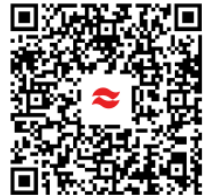
Android QR Code