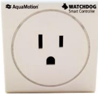
(1) WI-FI Smart Controller (Model: AMK-SC)