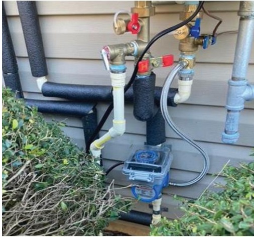
OUTDOOR INSTALLED AMH1K-7ODRXZT1