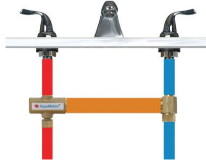
AMK-ODR2 Brass by-pass valve installs under sink in 10 minutes